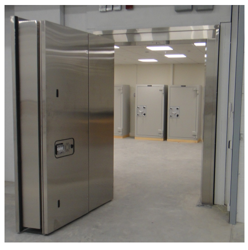
Class III individual vaults

All of our armed security staff are highly trained and licensed former law enforcement professionals.